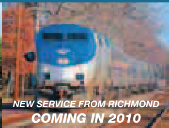
NEW SERVICE FROM RICHMOND COMING IN 2010

You'll fall for two new Amtrak Northeast Regional SM trains that provide direct service between central Virginia and the Northeast Corridor. Amtrak Virginia offers a one-seat ride to nearly 30 stations as far north as Boston and as far south as Lynchburg and Richmond with stops in Washington, D.C., Philadelphia, New York and more.