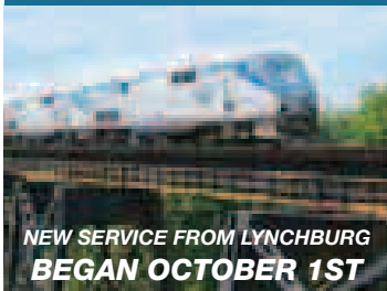
NEW SERVICE FROM LYNCHBURG BEGAN OCTOBER 1ST