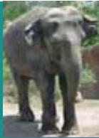
St. Louis Zoo