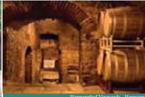
Hermannhof Vineyards - Hermann

Schedule your trip at Amtrak.com . Plan your adventure at visitmo.com .