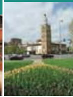
The Plaza - Kansas City