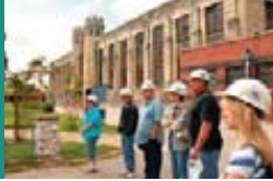
Missouri State Penitentiary - Jefferson City

Kansas City Independence Lee's Summit Warrensburg Sedalia Jefferson City Hermann Washington Kirkwood St. Louis