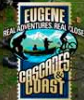
Covered Bridges Scenic Bikeway, Cottage Grove — with public transportation available from Eugene.

Bring your bike or rent one when you get here. To visit Oregon's Covered Bridges Scenic Bikeway, call 800.547.5445 or EugeneCascadesCoast.org/AMTRAK